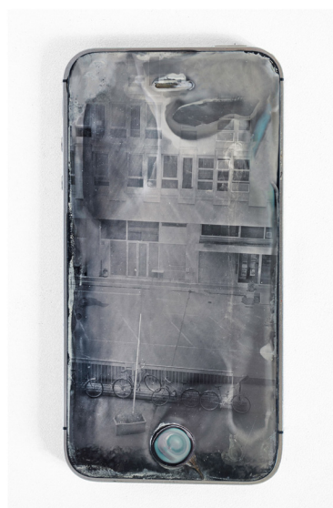
Implosion K Rochester (2022) - UV print, smartphones (iPhone 5) - Digitally simulated work on the left / Test with collodion technique on iPhone 4 on the right